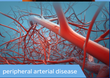
peripheral arterial disease

Global VP Medical Affairs Johnson & Johnson MedTech Surgery