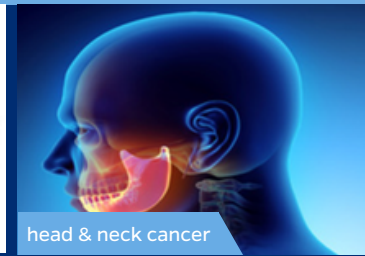
head & neck cancer